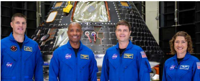
Jeremy Hansen, mission specialist; Victor Glover, pilot; Reid Wiseman, commander; and Christina Hammock Koch, mission specialist.