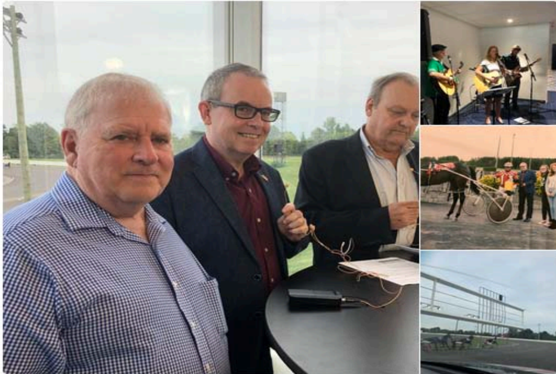
Irish Society NCR, Rideau Carleton Raceway and Irish Radio Canada

Great to be with our friends from @IrishSocietyNCR at @RideauCarleton Raceway, Ottawa last night for the Society's annual fundraiser #IrishNightattheRaces 🍀🏆🐎 – at Rideau Carleton Raceway