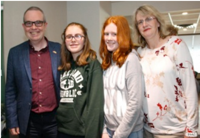
Ireland's "First Family" in Canada